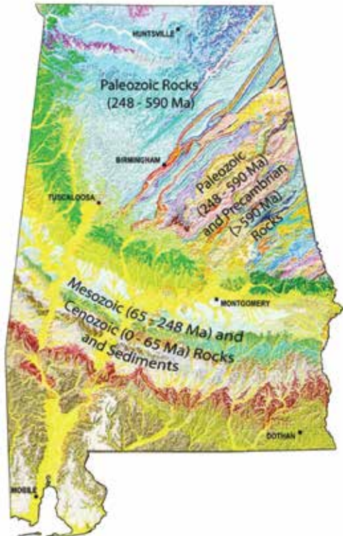
Geological Map of Alabama.